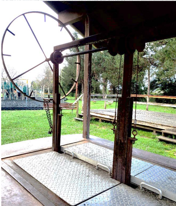
Community Barbeque Design - Custom Made