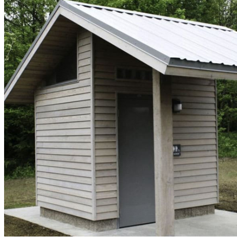
SST® Aspen Single.

The Romtec Model 1011 is a compact waterless restroom that provides a complete ADA compliant vault toilet. It has a single-occupant restroom that includes Romtec odor prevention SST ventilation system. Romtec offers many types of siding packages and accessories. Whether your restroom building requires stone wainscot, split-face CMU block, or painted hardy board and batten, Romtec can provide any of these options at a fair price.